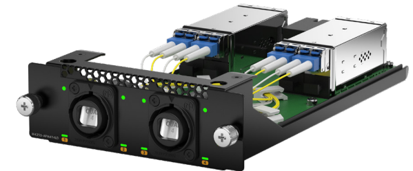
APM414LD 2 x opticalCON QUAD for 4 x SMF 10G or 25G