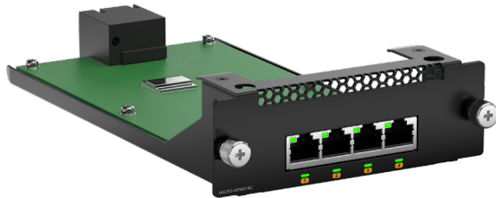
APM414C 4 x 10GBASE-T 1G or 10G