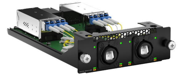
APM414SD 2 x opticalCON QUAD for 4 x MMF 10G or 25G

APM414C-10000S: 4 standard 10GBASE-T RJ45 ports